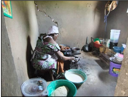
Light enables Paulina to cook in the evening

Liu Liu can forward the full report to anyone interested in seeing it.