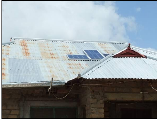
The panels that provide the light