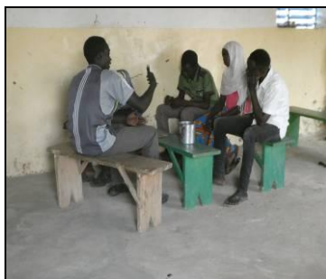
Men listening to God’s Word