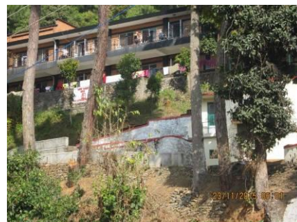
Earthquake damage at Anandaban Hospital

BRBC folk also made donations towards Heal Nepal in 2019 totalling £1826.55. After adding government match funding, this achieved £3253.10. Again a very big Thank You to all at BRBC!